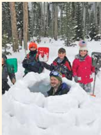
Children and Teens learn how to construct igloos, snow caves and other improvised shelters

Let the Kids Escape You: Big Sky offers an array of children's activities ranging from ski schools to dog rescue demonstrations, to regular evening movies. And kids 10 and under ski free!