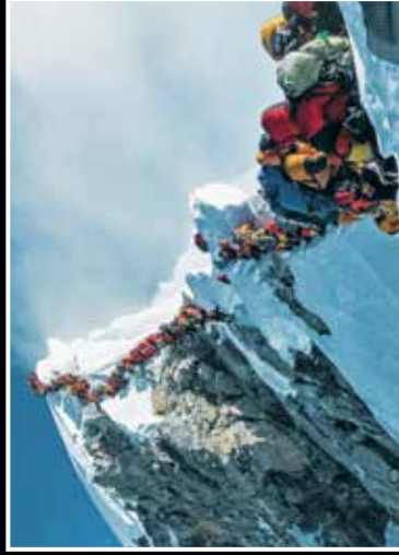
Long queue of climbers line a path to the summit of Everest on May 22, 2019.