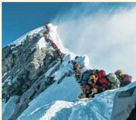
Iconic image of deadly traffic jam near the top of Mount Everest this past Spring.