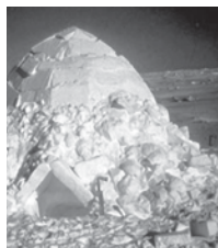
Learn to build igloos and other snow shelters

GARY KIBBEE: Navy Seal; Special Forces Survival Instructor; swiftwater rescue, high angle rescue, and dive rescue instructor; specialist in tactical and wilderness medicine, escape and evasion, and confined space rescue.